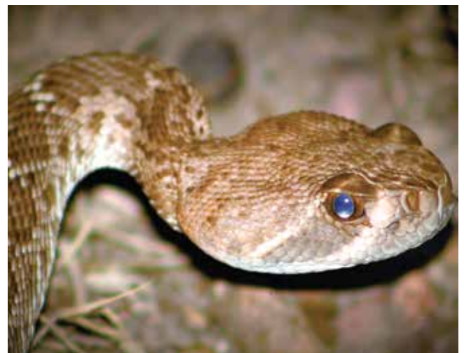
RIGHT: Children 12 & Under First Place Western Diamondback (Red Diamond) by Claire Meng