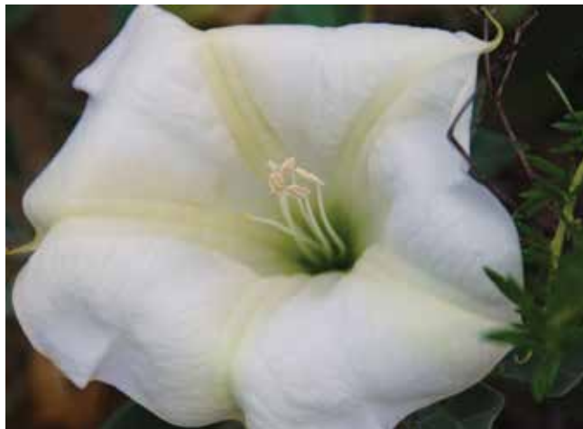
RIGHT: Youth (13-17) Digital First Place Untitled by Nefret Allen-Cantu