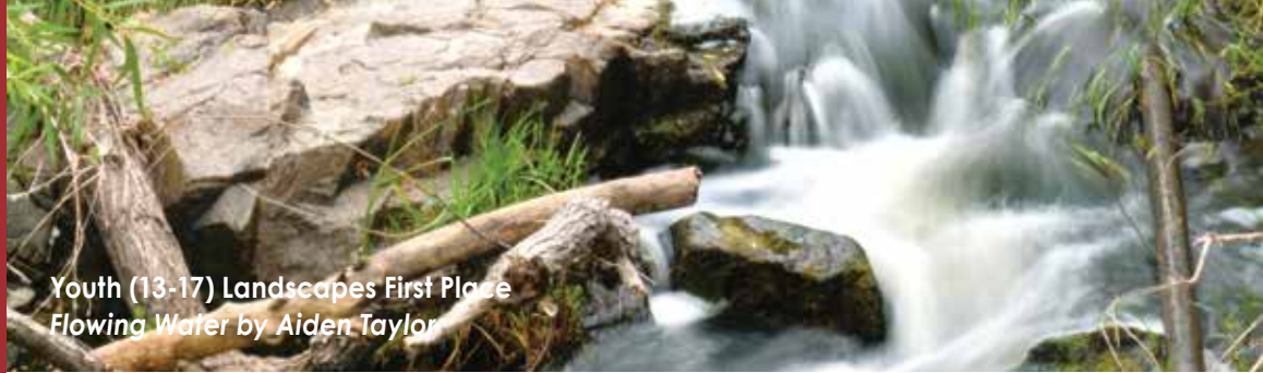
Youth (13-17) Landscapes First Place Flowing Water by Aiden Taylor