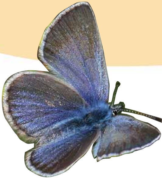
Silvery Blue - Glaucopsyche lygdamus