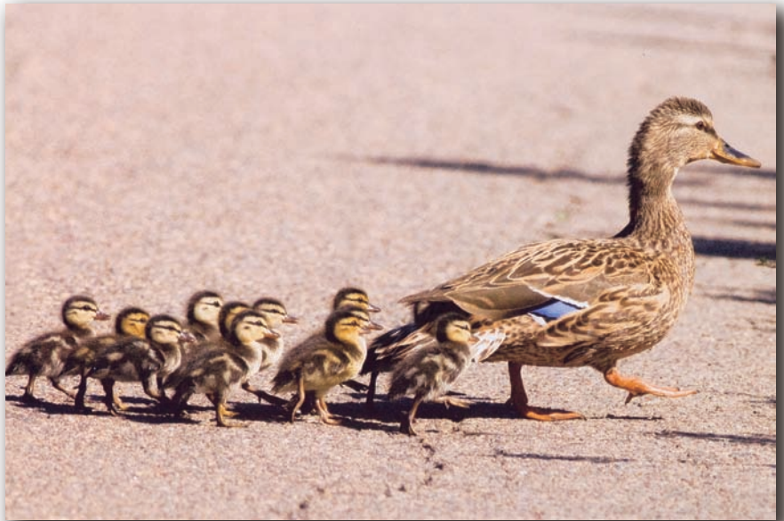
Bill Casper - Ducklings by the Dozen