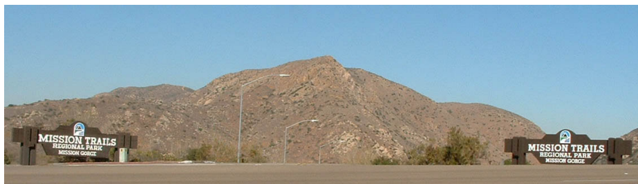
Twin signs once again stand sentinel over the main entrance