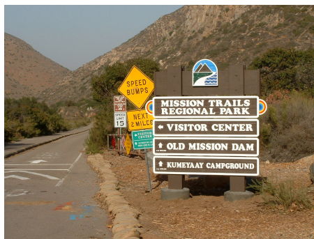
The new sign for the Visitor Center

A new sign has been installed at the intersection of the Visitor Center Driveway and Father Junipero Serra Trail. Due to the small size of a previous sign and the camouflaged nature of the Visitor Center, new visitors to the park had a difficult time finding their way. To alleviate this problem, a seven foot wooden sign with large letters was constructed by Kitt Sign Company. The new sign not only directs people to the Visitor Center, but also gives directions and mileage to the Old Mission Dam and Kumeyaay Lake Campground.