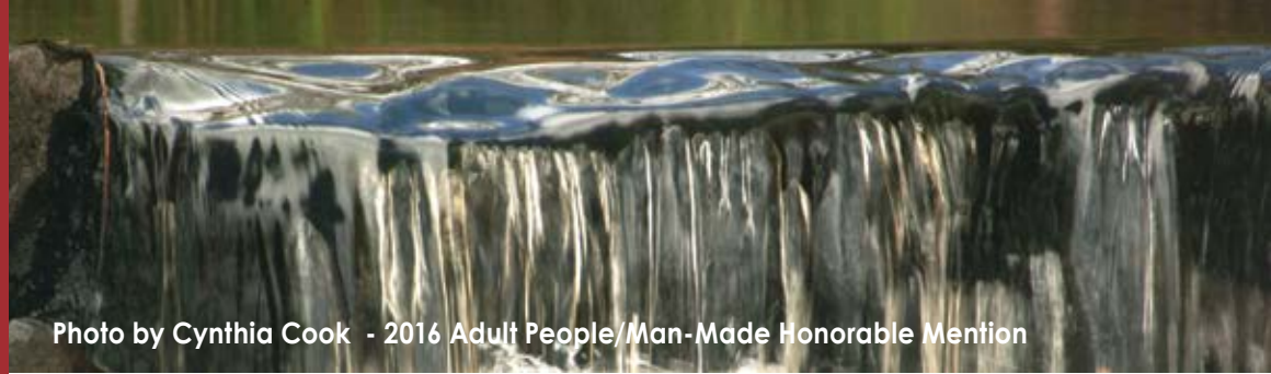
2016 Adult People/Man-Made Honorable Mention