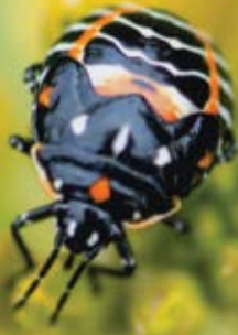
2016 Adult Fauna Second Place