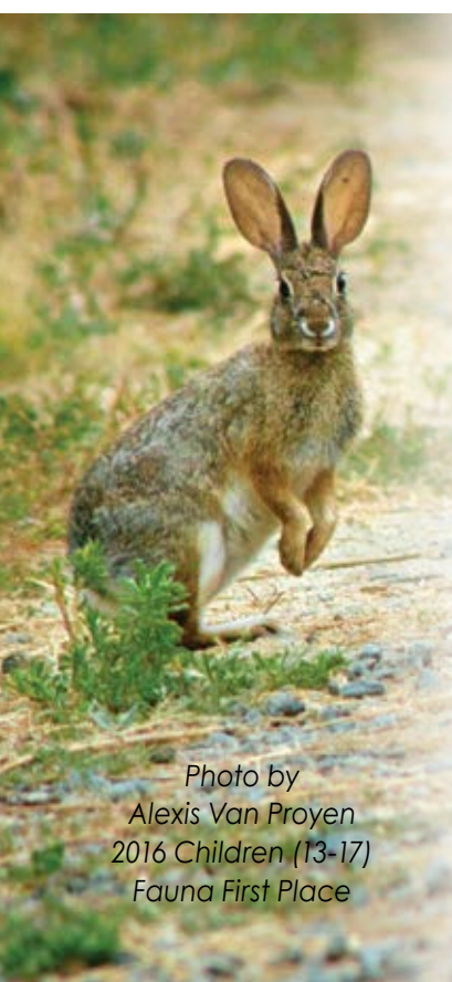
2016 Children (13-17) Fauna First Place

We hope you manage to stay cool this summer! ■